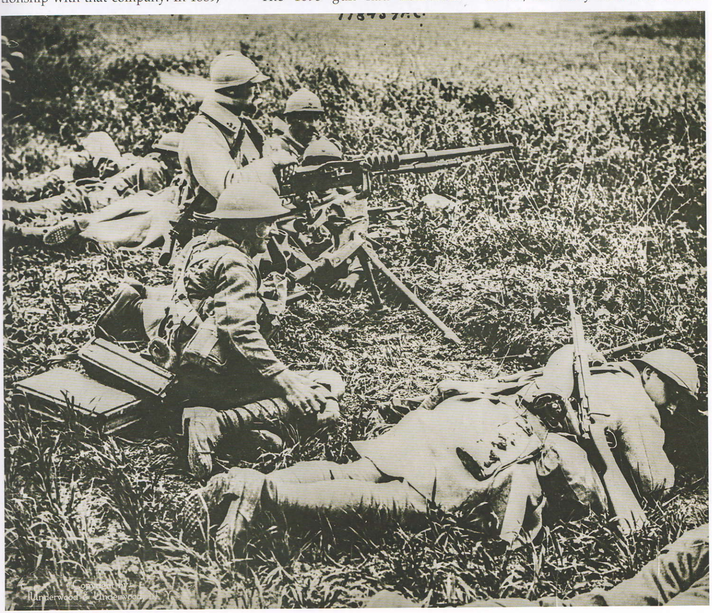
Three French soldiers and a British soldier operating a Hotchkiss machine gun.

By 1900 Browning had already concluded that a recoil-operated system was best, and patented a water-cooled model in 1901. He then let the project lie; the many other firearms he