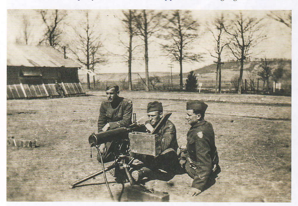
Members of the 314th Machine Gun Company, 79th Division, training with a Browning.30-caliber machine gun.