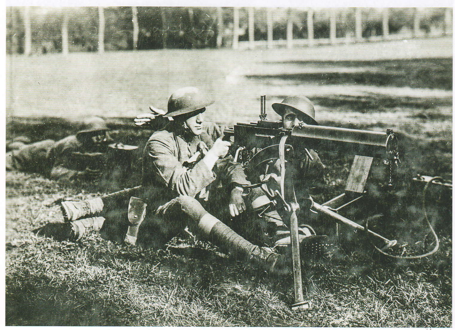
Closeup of gun crew with .30 cal. Browning MG, 83rd Division, October 1, 1918.