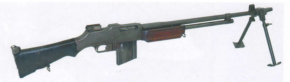
Browning Automatic Rifle, this rifle is part of the United States Army Heritage and Education Center.

Dubbed the Browning Automatic Rifle or "BAR," it debuted in 1917 at the same February and May firings as Browning's heavy machine gun. It met with quick approval and a contract was awarded to Winchester for 25,000 units. Company lore has it