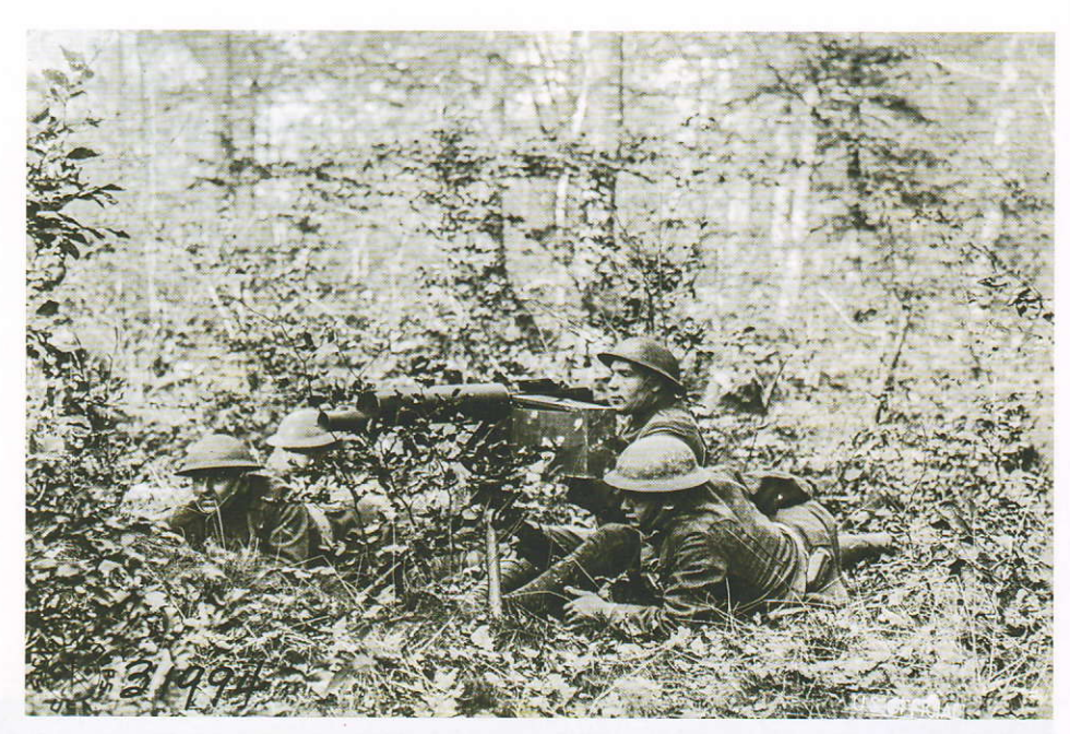
Over the Top: A Browning .30 cal. machine gun crew of the 315th MG Battalion creeping toward the enemy lines through the woods between La Chalade and Claon, Meuse, October 29, 1918.

Although it received rave reviews, the Army felt the gun required further testing. That May at the Springfield Armory, Browning fired off 20,000 rounds at 600 rounds per minute without a stoppage. An Army board quickly recommended it for immediate purchase. Besides its reliability, they liked its simple design; it could be dismantled and reassembled by a blindfolded operator in a few minutes. Its only drawback was that it