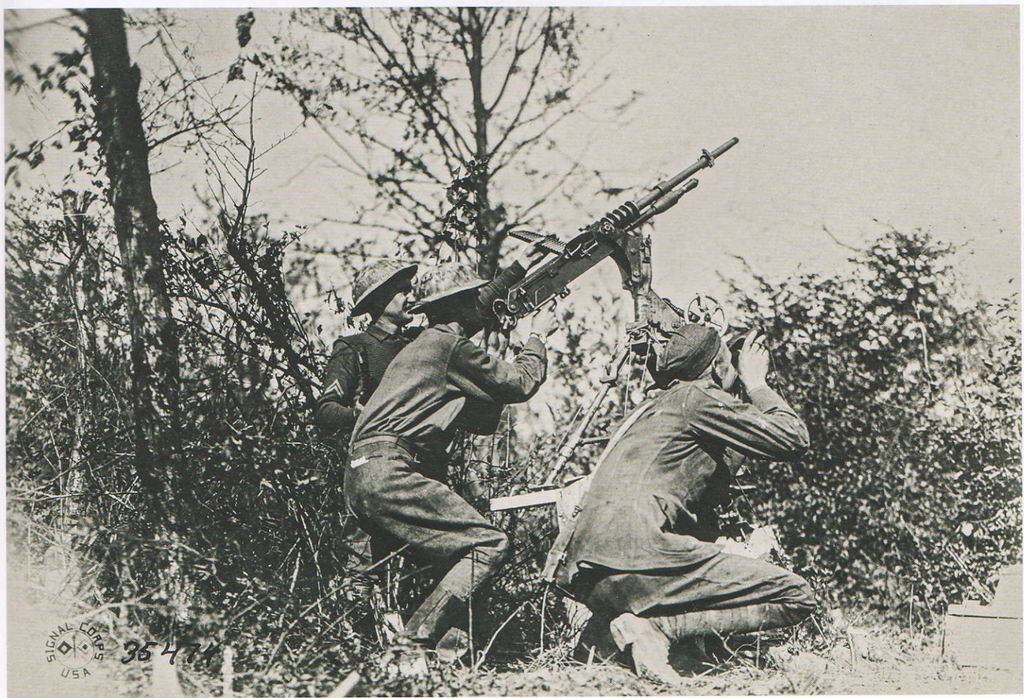
Hotchkiss machine gun being used against a German airplane near Cunel, Meuse-Argonne. Courtesy of the National WWI Museum and Memorial.

American officer, Montdidier Front, firing a Hotchkiss MG at German airplanes, May 20, 1918. WWI Signal Corps Collection, United States Army Heritage and Education Center, Carlisle, Penn.